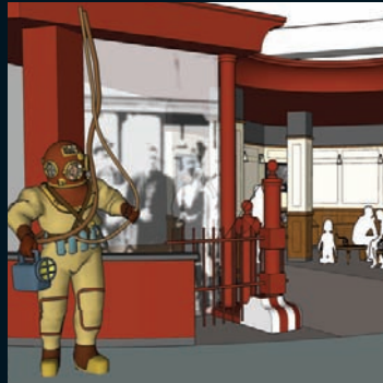
Rendering: Metcafe Architecture