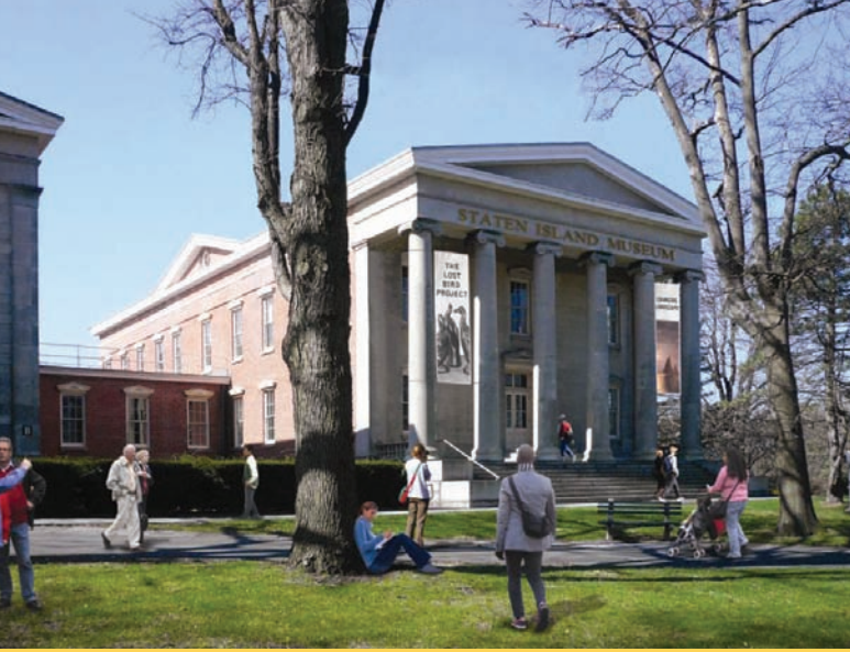
Future home of the Staten Island Museum, Building A at Snug Harbor Cultural Center campus.